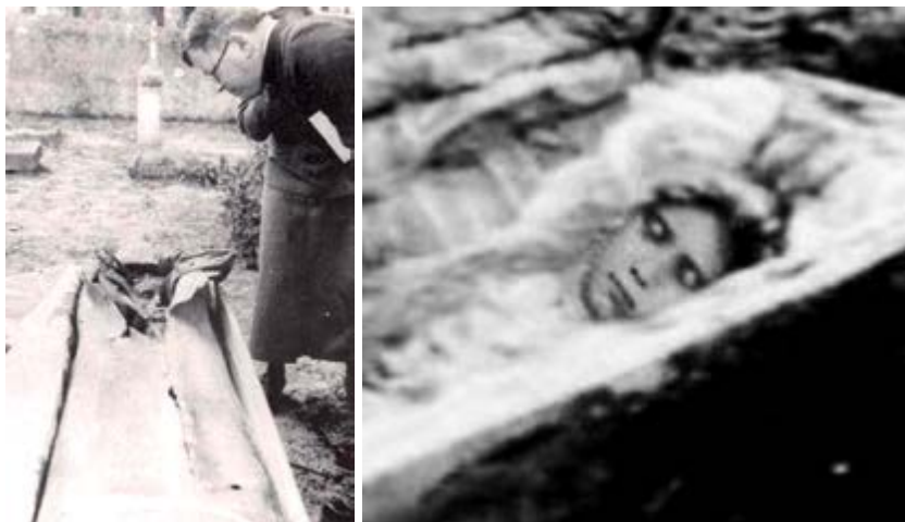
The incorrupt body of Blessed Jacinta Marto during the exhumations of 1935 and 1951

lifting up of our souls towards God to adore, praise, and thank Him, to ask pardon for our sins, and to obtain graces for us. The second is to ask for graces for one's neighbour, such as his conversion, his sanctification, or for anything else profitable to his soul. Our Lady had this second prayer in mind when she asked the children to pray for the conversion of sinners. Prayer to God on behalf of others is an essential part of the fulfillment of the great commandment to love one's neighbour. Jacinta's example steers us away from activism or an exaggerated use of human means in the apostolate. None of the external activities and projects of the apostolate are, of themselves, capable of converting even one soul, for conversion is firstly the work of divine grace. The work of the apostolate consists in the turning of the will, which is prone to evil, towards what is good, so that